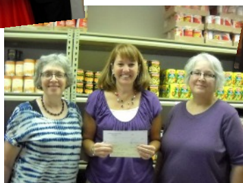
St. Stephen Lutheran Pancakes 4 Pantry