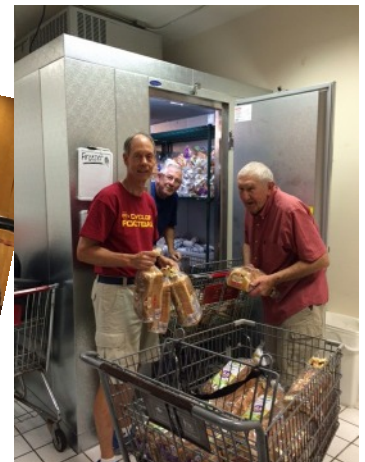
Walk-in Freezer, Burk Foundation Grant